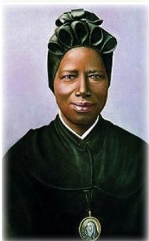
SAINT JOSEPHINE BAKHITA 1869 - 1947 Feast Day, 8 February

Requesting those who are helping clean the church on the weekends to please contact the parish office on 9637 1062, or email stoliva@bigpond.net.au , so we can create the roster for 2018. Please let us know your preferred times during the month, i.e., 1 st , 2 nd , 3 rd , 4 th , 5 th Saturday/Sunday, so we can come up with the cycle for the whole year. Please leave a message if the phone is unattended. Many thanks again for all your time and hard work.