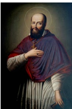
SAINT FRANCIS DE SALES , 1567—1622 Feast Day, 24 January